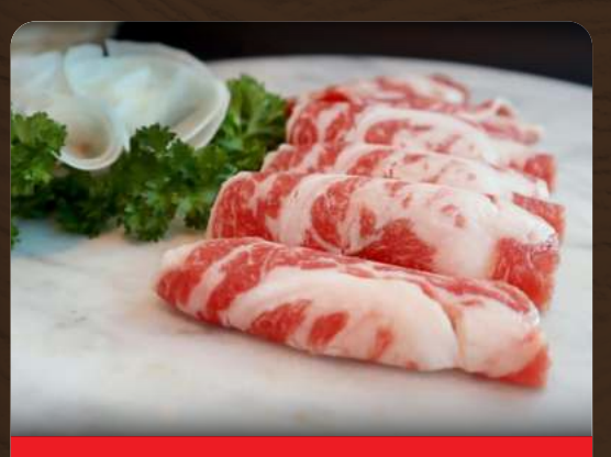
US Beef Short Plate (Shabu) Half $12.90 | Full $25.90