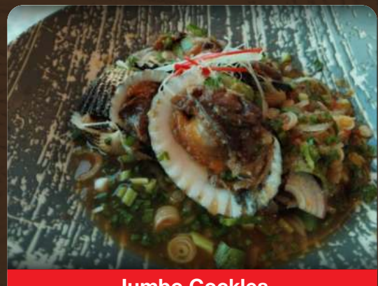
Jumbo Cockles in Thai Seafood Sauce $18.00