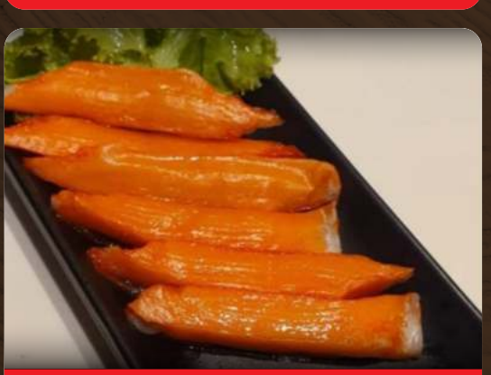
Japanese Crab Stick 6pcs: $4.00 | 14pcs: $8.00