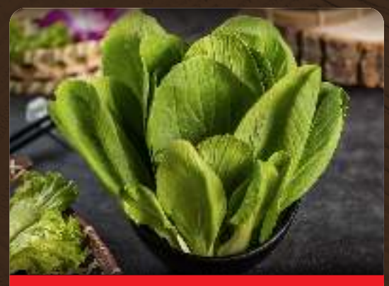
Xiao Bai Cai Half $3.00 | Full $6.00