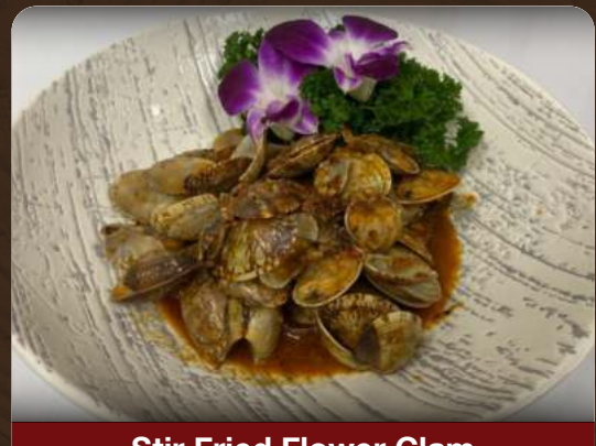
Stir Fried Flower Clam in Superior XO Sauce $29.90