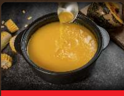
Pumpkin Soup Half $11.90 | Full $18.90