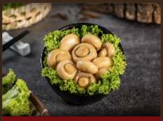
Button Mushroom Half $4.00 | Full $8.00