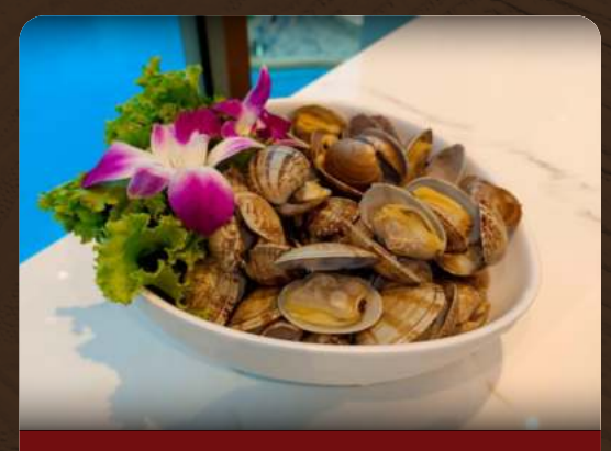
Fresh Clams $9.90