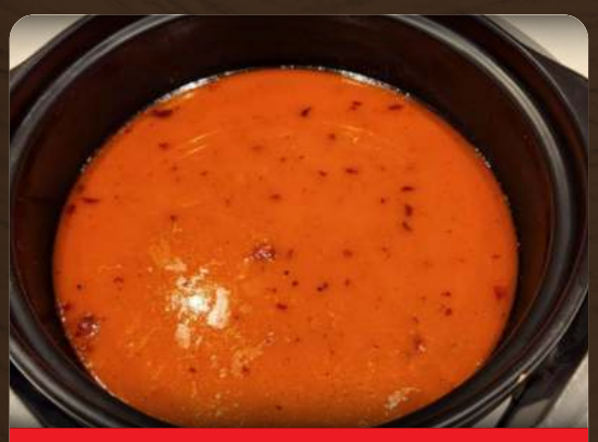
Mala Tang Soup Half $11.90 | Full $18.90