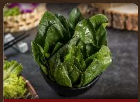
Spinach Half $3.50 | Full $6.90