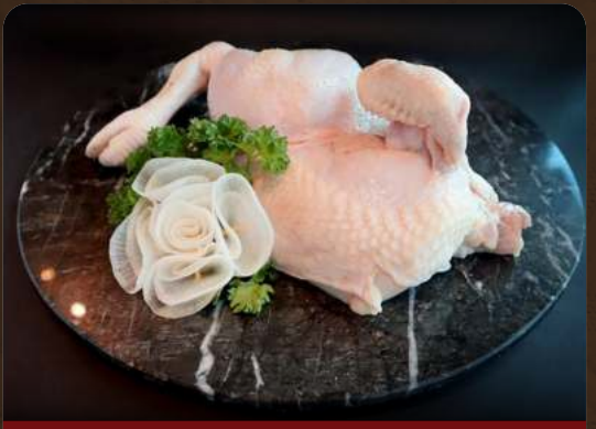
Half Chicken $12.90