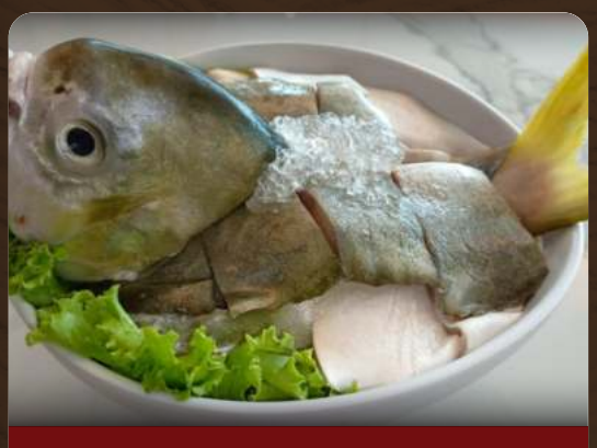
Golden Pomfret $15.90