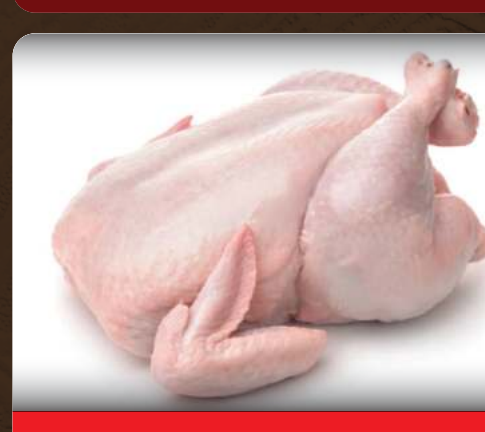
Whole Chicken $28.90