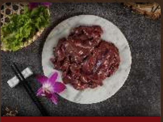
Pork Liver 6pcs: $3.90 | 12pcs: $7.90