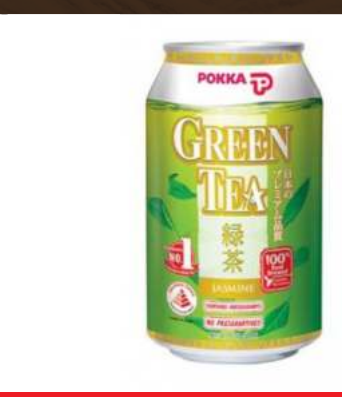
Pokka Green Tea $3.50