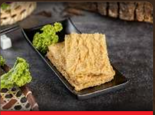
Square Tau Kee $5.90