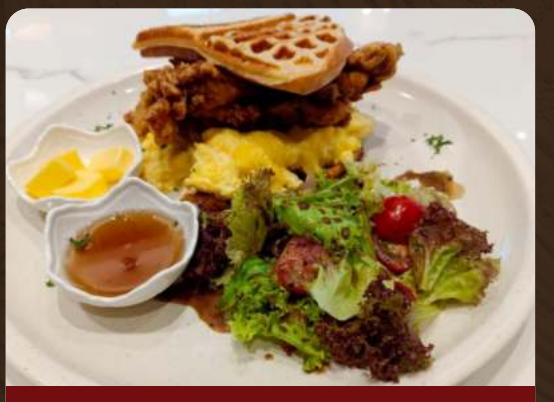
Chicken Cutlet on Waffle $9.90