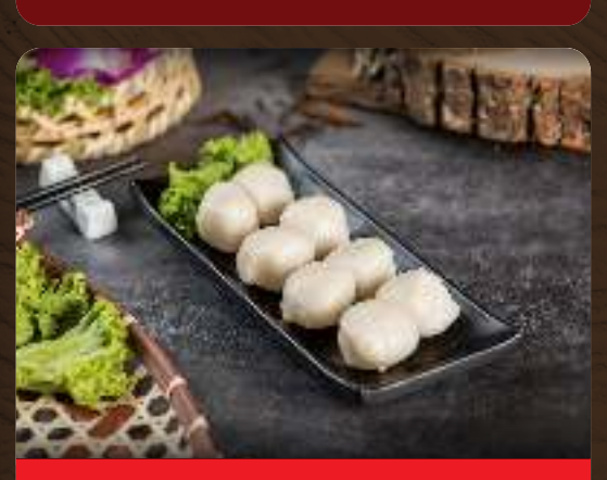
Fresh Fishball 8pcs: $4.90 | 14pcs: $9.80