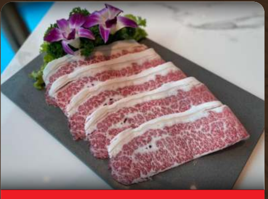
Japanese Wagyu Short Plate 80-90g: $24.90