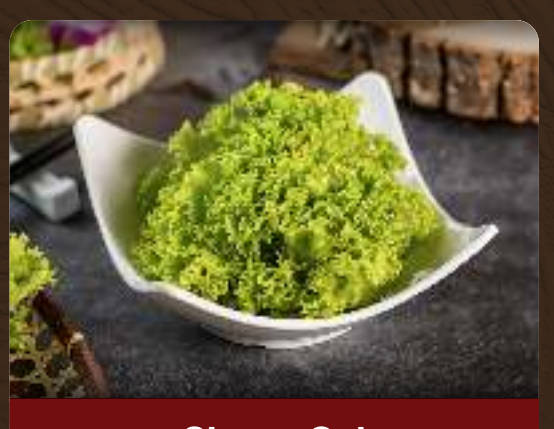
Sheng Cai Half $3.50 | Full $6.90