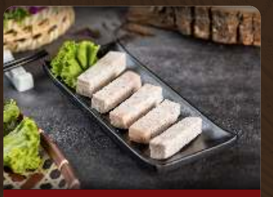
Taro Half $4.90 | Full $9.90