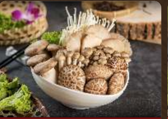
Mushroom Platter $16.90