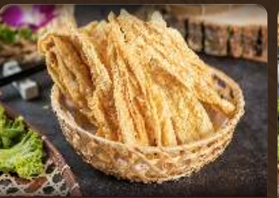
Hand Fried Tau Kee $5.90