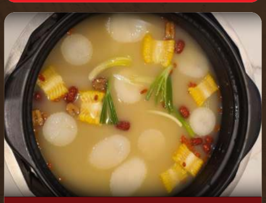
Superior Chicken Soup Half $11.90 | Full $18.90