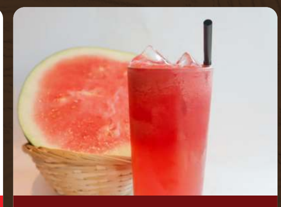
Watermelon Juice $5.90