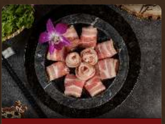
Pork Belly Half $9.90 | Full $19.90