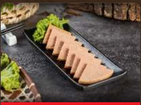
Luncheon Meat 8pcs: $4.90 | 15pcs: $9.90