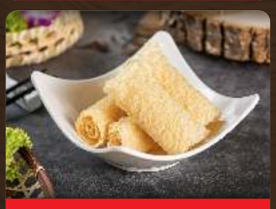
Beancurd Roll 6pcs: $4.90 | 10pcs: $9.90