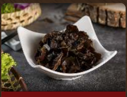
Black Fungus Half $3.50 | Full $6.90