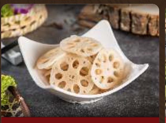
Lotus Root Half $4.90 | Full $9.90