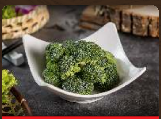
Brocolli Half $3.50 | Full $6.90