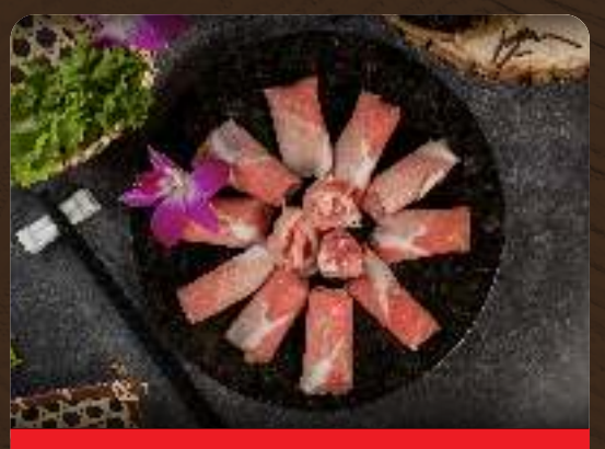
Pork Collar Half $9.90 | Full $19.90