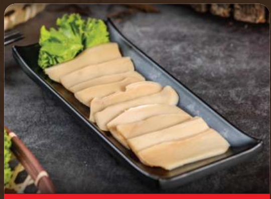
Mock Abalone Slice 10pcs: $4.00 | 18pcs: $8.00