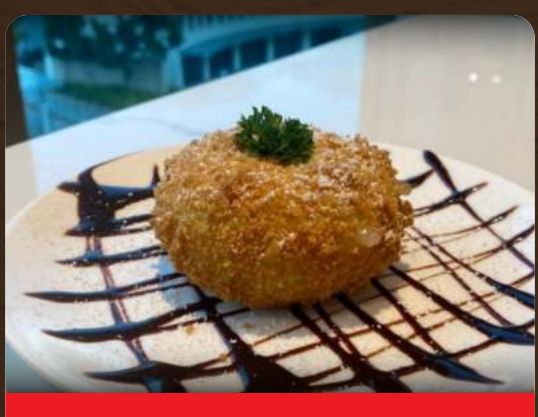
Deep Fried Durian Mochi (Seasonal) $7.90