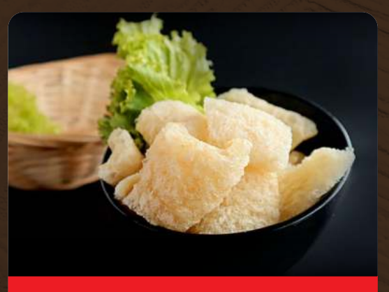
Fried Pork Skin Half $3.90 | Full $7.90