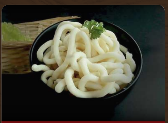
Fish Noodles $6.90