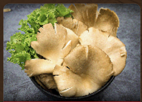
Abalone Mushroom Half $4.50 | Full $7.90