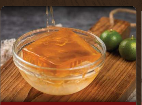
Ai Yu Bin $3.90