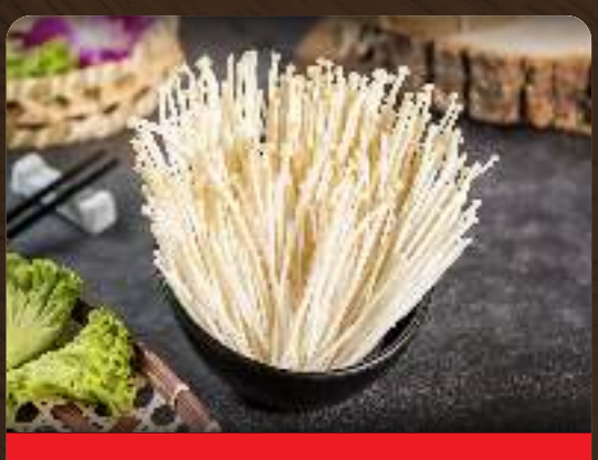
Enoki Mushroom Half $4.50 | Full $7.90