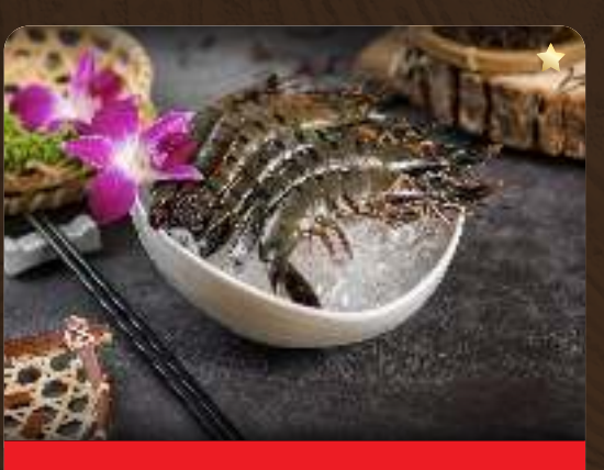
Tiger Prawn 5pcs: $`10.90 | 8pcs: $19.90