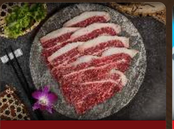
Japanese Wagyu Chuck 120g: $67.90 | 300g: $135.90