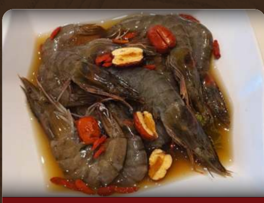
Drunken Prawn $14.90