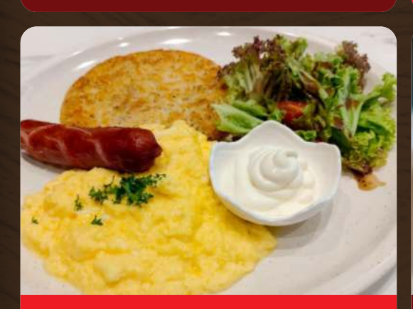
Rosti Plate $10.90