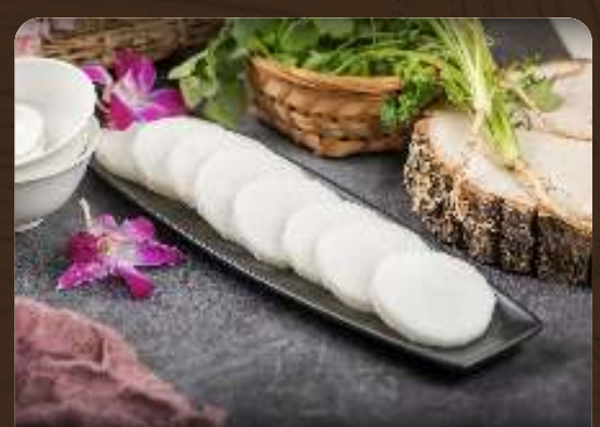
White Raddish Half $4.00 | Full $8.00