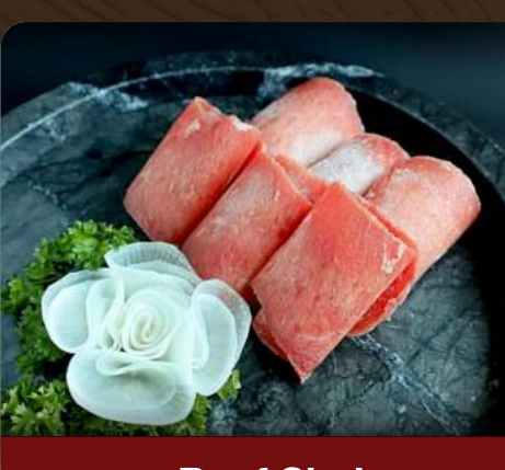
Beef Shabu Half $11.90 | Full $23.90