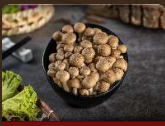
Shimeji Brown $5.90