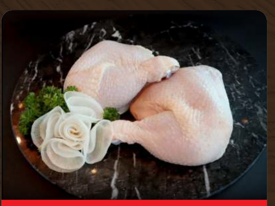
Whole Chicken Thigh 1pc: $8.90 | 2pcs: $11.90