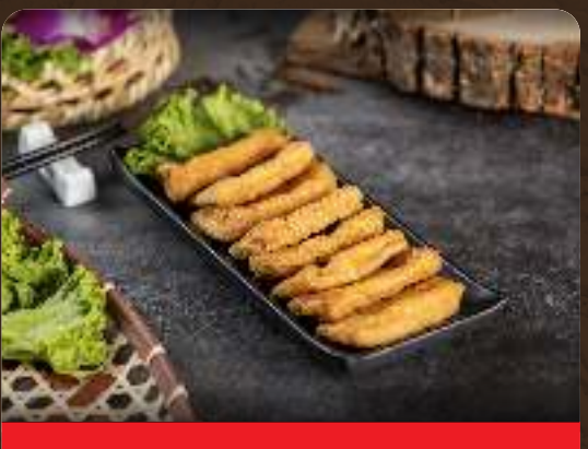
Tau Pok Half $3.90 | Full $7.90