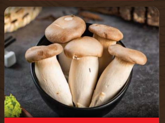
King Oyster Mushroom Half $4.50 | Full $7.90