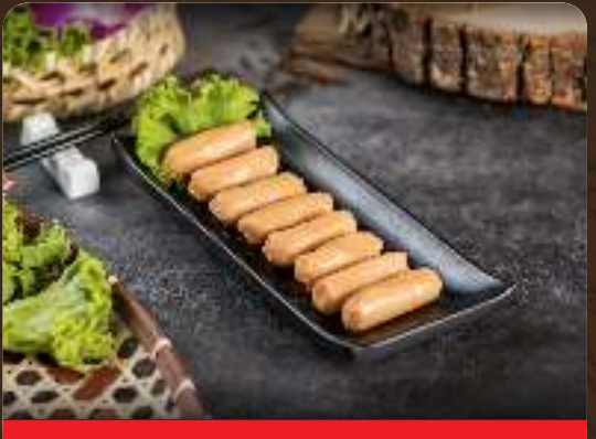
Chicken Sausage Cocktail 8pcs: $4.90 | 14pcs: $9.90