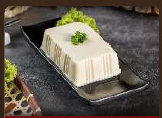
Silken Tofu $4.90