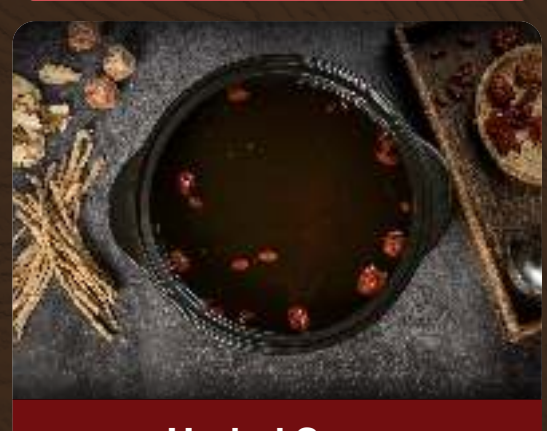
Herbal Soup Half $11.90 | Full $18.90