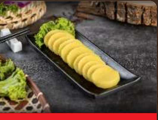
Potato Slice Half $3.50 | Full $7.00