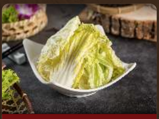
Long Cabbage Half $3.50 | Full $6.90