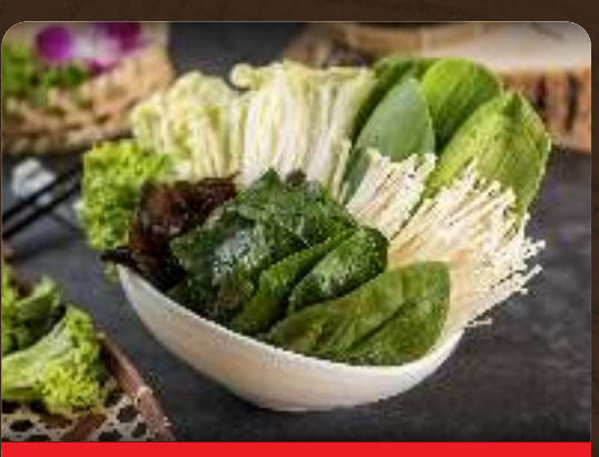
Vegetable Platter $16.90