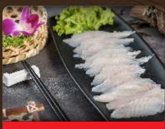
Dory Fish Slice 8pcs: $5.90 | 14pcs: $11.90