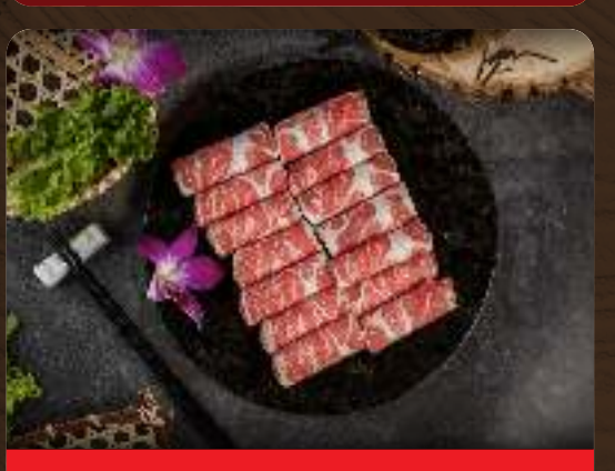
Iberico Pork Collar Half $18.90 | Full $38.00