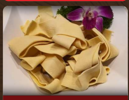
Beancurd Skin $3.50