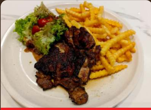
Smoky Chicken Chop with Fries $9.90