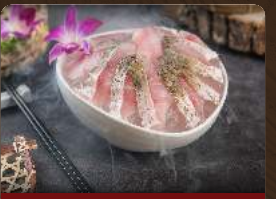
Seabass Slice Half $9.80 | Full $18.90