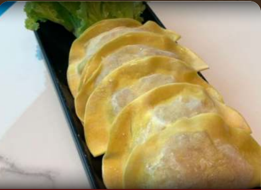
Handmade Ah Gong's Dumpling $7.90