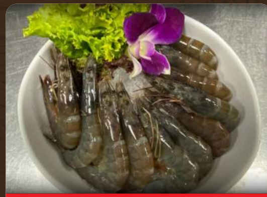
Grey Prawn $9.90