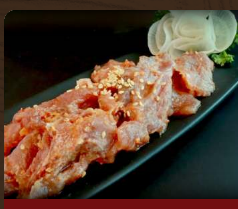
Marinated Beef (Striploin ( Half $10.90 | Full $21.90