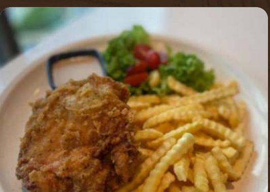
Chicken Cutlet with Fries $9.90