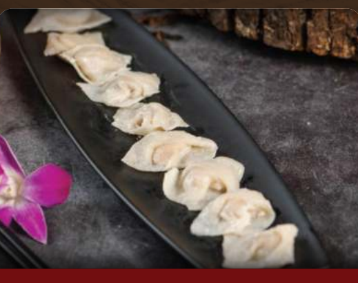
Teo Chew Fish Dumpling $5.90