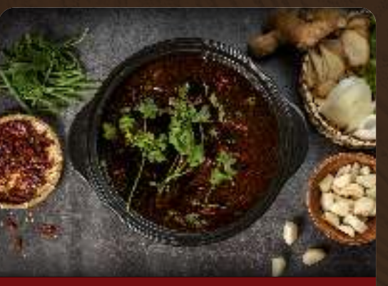
Signature Broth Soup Half $11.90 | Full $18.90