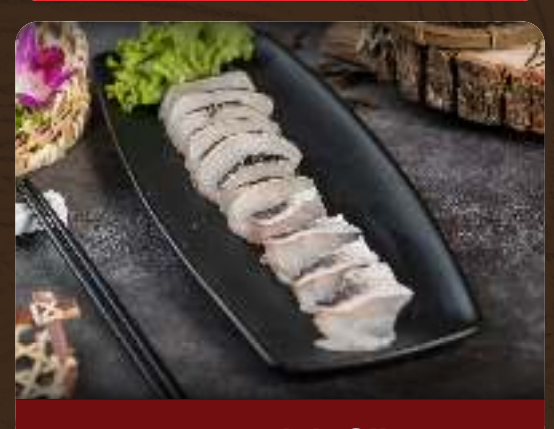
Toman Fish Slice 8pcs: $8.90 | 14pcs: $17.90