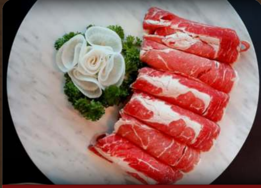
US Beef Ribeye (Shabu) 6pcs: $19.90 | 10pcs: $39.00