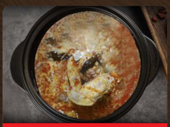
Laksa Half $11.90 | Full $18.90