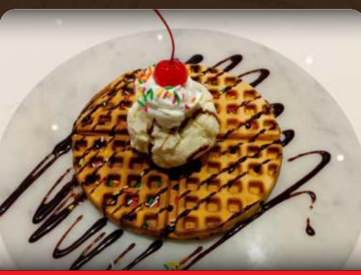
Waffle Ice Cream (Single Scoop) $5.90