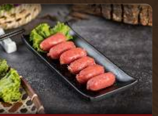
Taiwanese Sausage 8pcs: $5.40 | 14pcs: $10.40