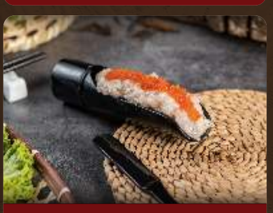
Shrimp Paste 150g: $9.90