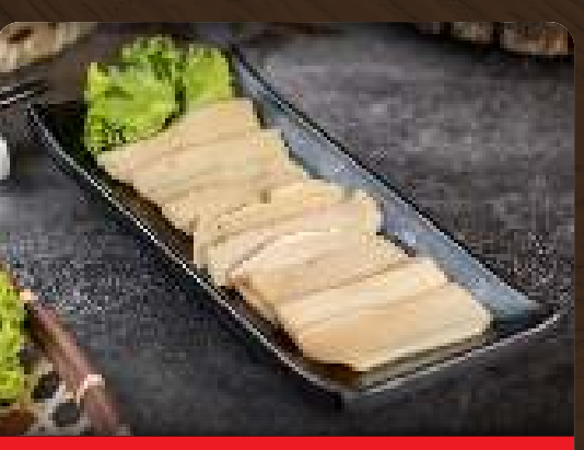
Cheese Tofu Half $3.40 | Full $6.90