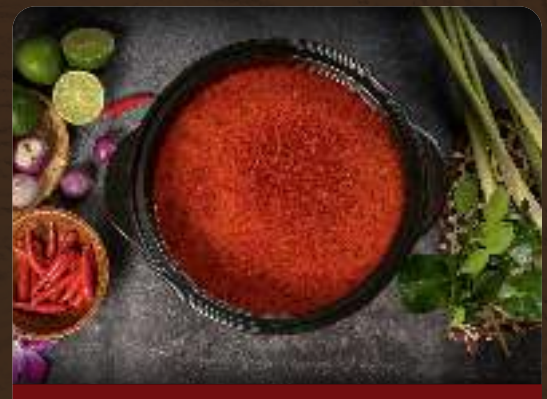
Tom Yum Soup Half $11.90 | Full $18.90