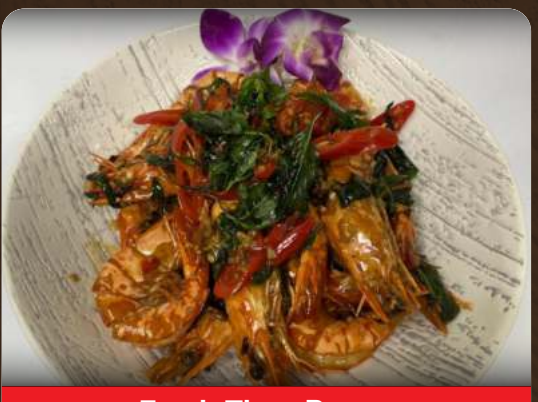
Fresh Tiger Prawn in Traditional Thai Basil 12-13pcs: $58.00