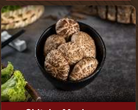
Shitake Mushroom Half $3.50 | Full $6.90