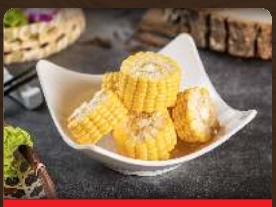
Sweet Corn Half $3.50 | Full $6.90